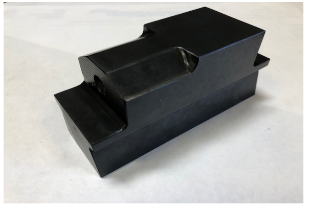
Combination Dies sold as set—matching upper and lower. H7/8 Combo workface 2"x 4" K7/8 Combo workface 2.5"x5" P7/8 Combo workface 3" x 8"