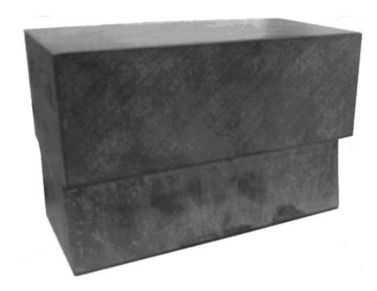
P8 Flat workface 3" x 6", 3" x 8", and 4" x 8"