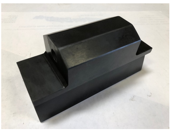
H8 Draw workface 2" x 3" K8 Draw workface 2.5" x 4"